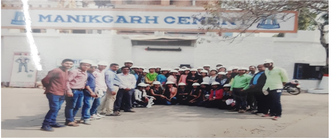
Educational tour at Manikgarh Cement, Gadchandur.