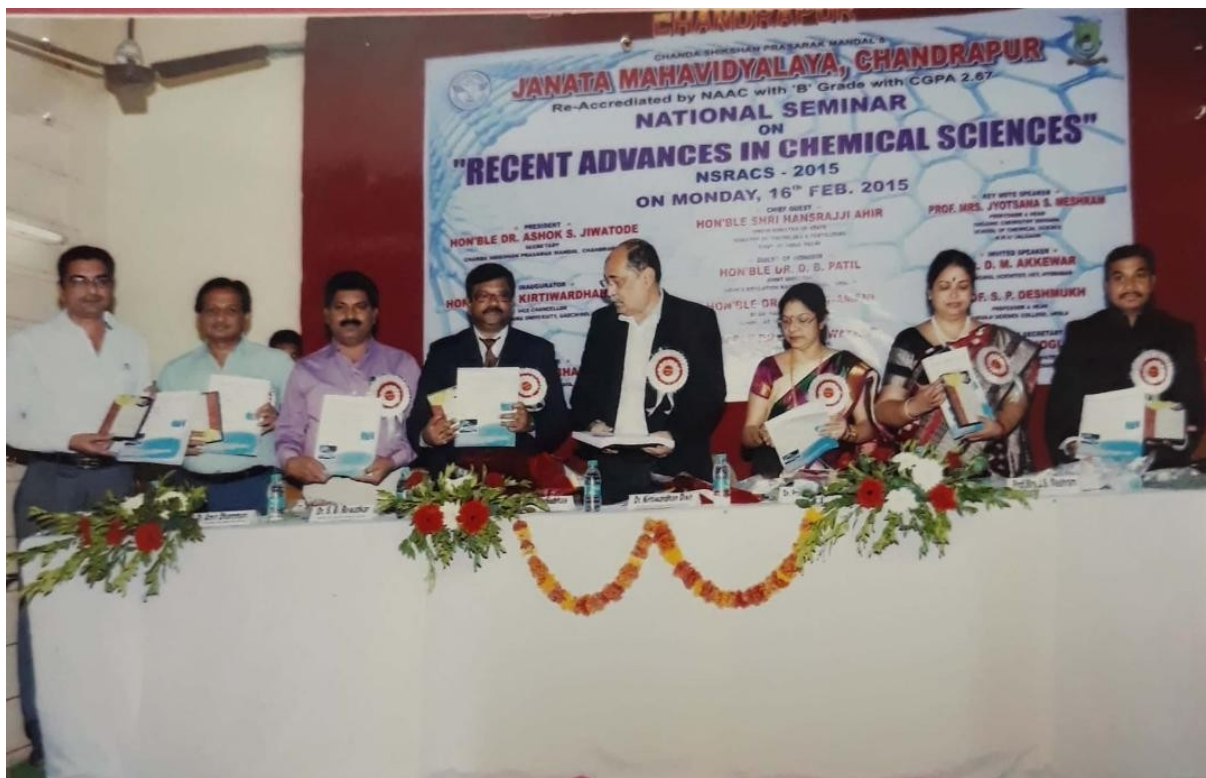
Organized UGC Sponsored National Conference on “Recent Trends In Chemical Sciences”