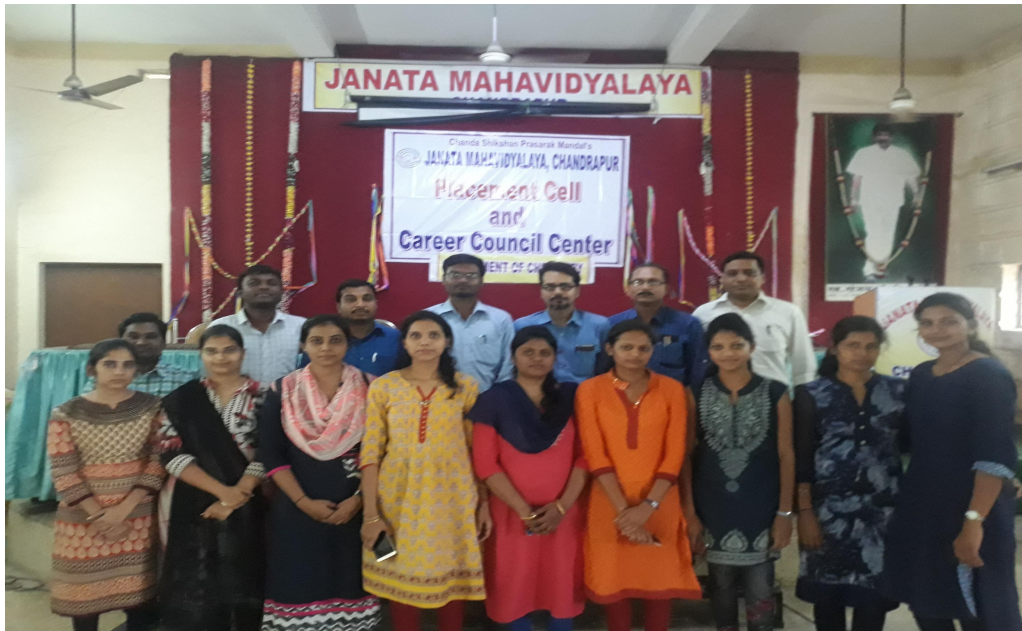
Organized one placement for P.G. Students in collaboration with Multi-organic Pvt. Ltd. MIDC, Chandrapur.