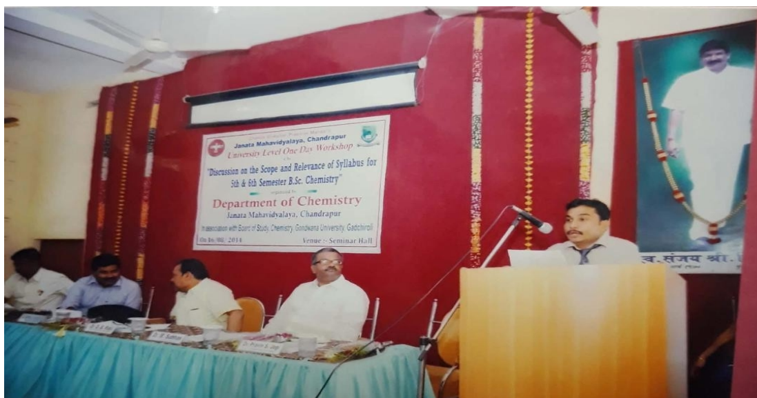
University level Work shop on Syllabus organized by department in