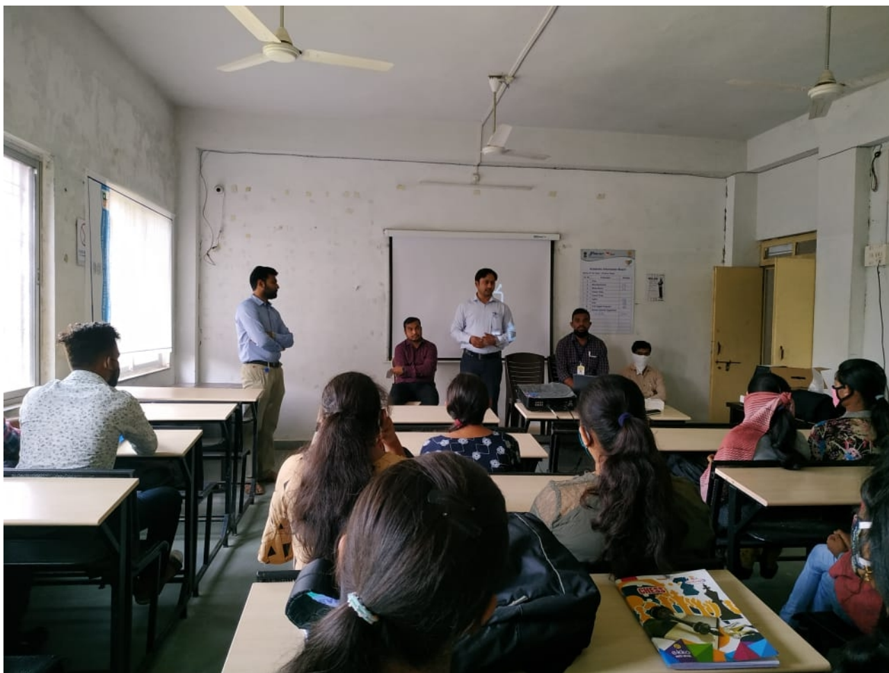
Certificate Course On “Plastic Materials & Modern Plastic Processing Techniques” ON DATED 27-10-20 TO 20-10-20