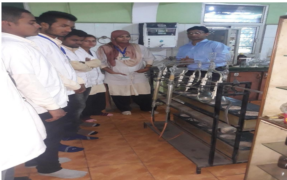
Educational tour at Deeni Chemicals Pvt. Ltd. MIDC, Chandrapur.