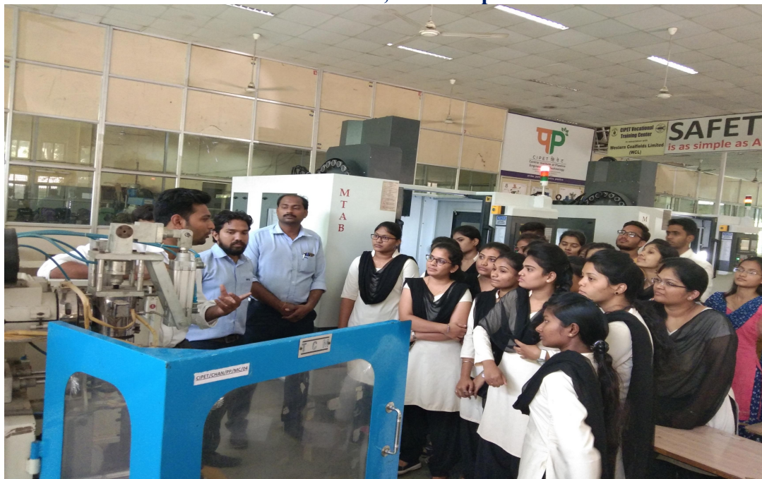
Training program for students at CIPET, Chandrapur