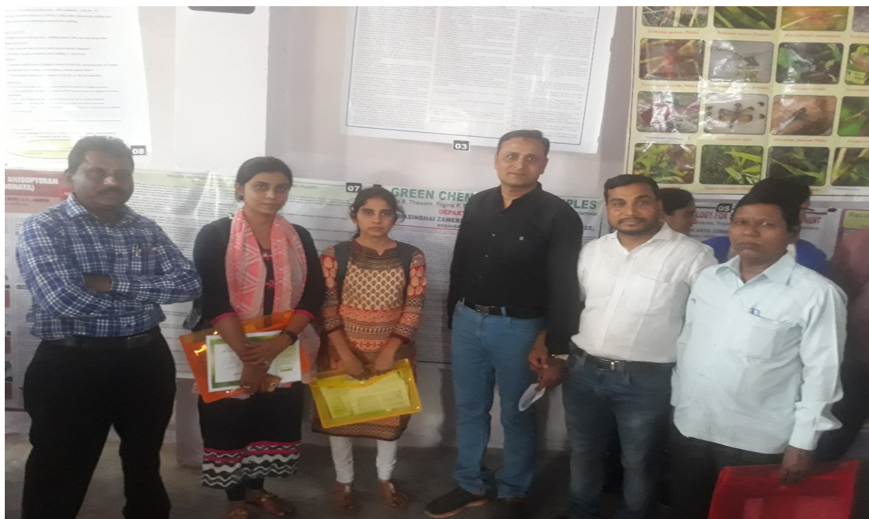
Poster presentation by PG students at national conference, Gramgeeta Mahavidyalaya, Chandrapur.