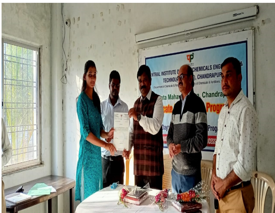
Certificate Course On “Plastic Materials & Modern Plastic Processing Techniques” ON DATED 27-01-21 TO 29-01-21