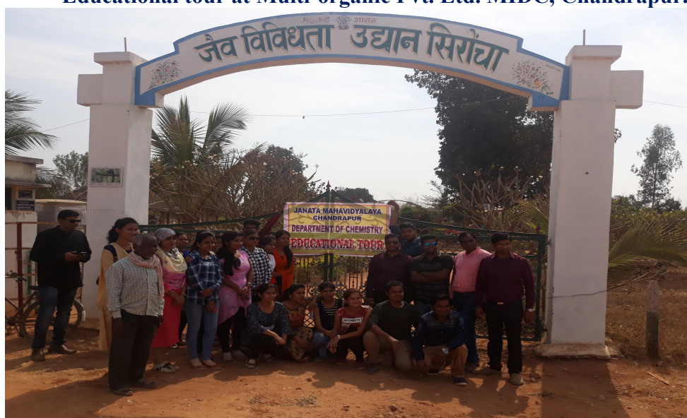
Educational tour at BIODIVERSITY PARK, SIRONCHA