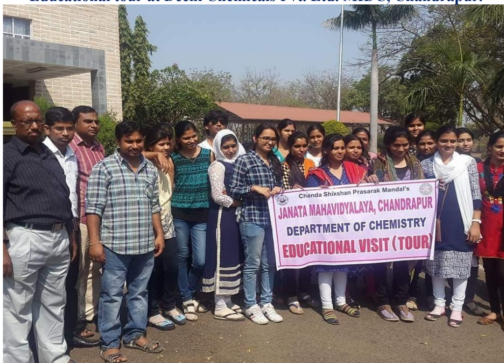
Educational tour at JNARDC, Nagpur.