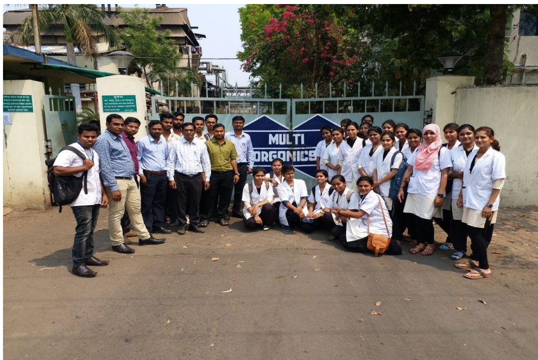
Educational tour at Multi-organic Pvt. Ltd. MIDC, Chandrapur.