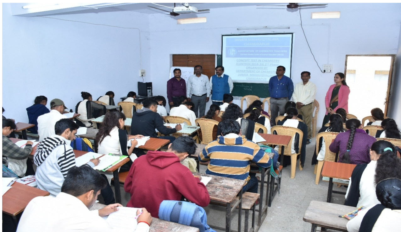
Organized concept test in chemistry, on dated 02-02-2019